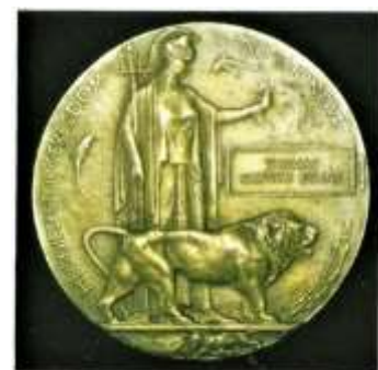
From left to right: 1914 Star, War Medal, Victory Medal, Memorial Plaque.