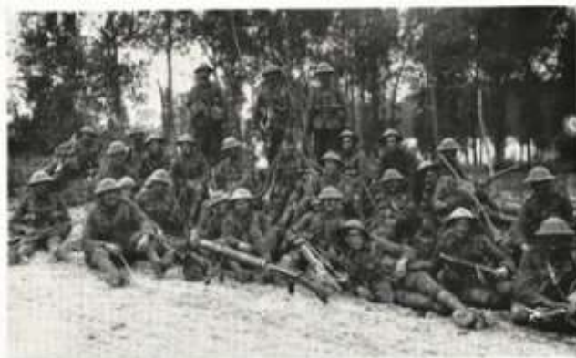
Imperial War Museum

1 st Bn Wiltshires soldiers after an attack