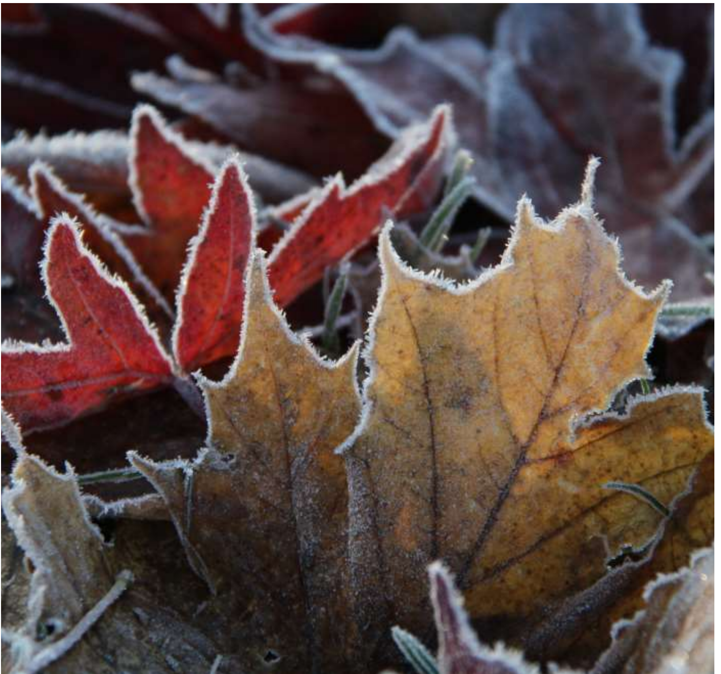
Frosty Leaves, Harvest Lane